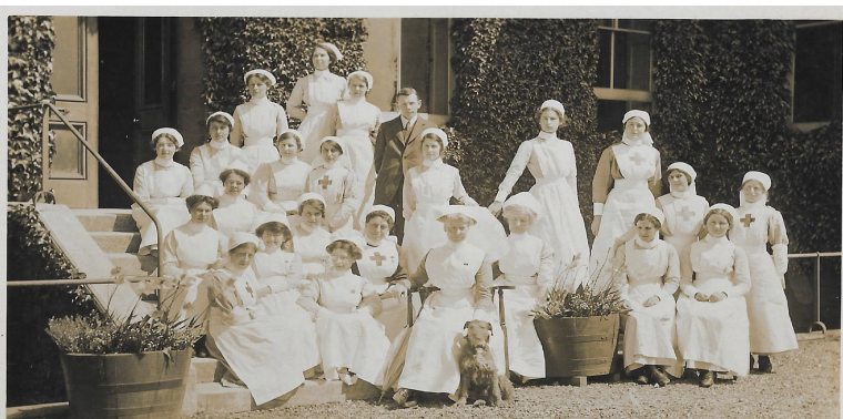
Historic Bury St Edmunds Nursing Staff and House Surgeon, Suffolk General Hospital.

Tickets £6, to include refreshments, from Thurston Library